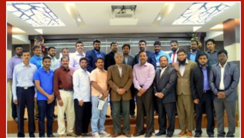
Oman Agm 2016