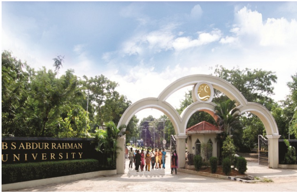
BSAU Alumni Association Newsletter: Issue 4 - December 2016