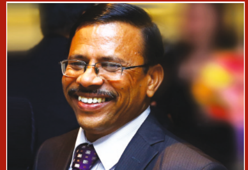
Staff of the Month