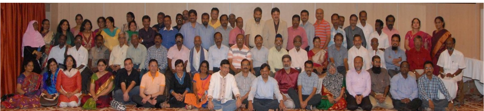
Crescent Graduates Silver jubilee Alumni Reunion 1985-89 Dec 2014 Chennai